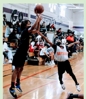
Oakland Athletic League South Champs; best record ever at 10-1